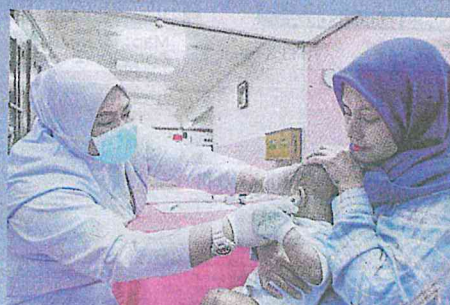
JURURAWAT mengambil bacaan suhu badan pesakit sebagai saringan awal mengenal pasti pesakit yang mempunyai risiko dijangkiti influenza.