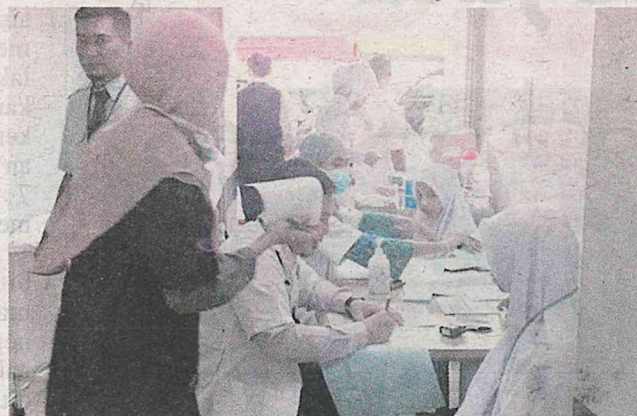
Pelajar SMAKJ Kluang melakukan pemeriksaan di HEBHK Kluang akibat keracunan makanan kelmarin.