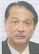
Datuk Dr Noor Hisham Abdullah