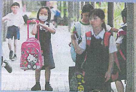
PELAJAR memakai topeng muka elak dijangkiti influenza.