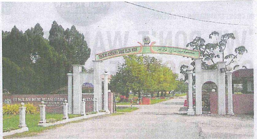
SMS Teluk Intan in Perak has been ordered to close until Sunday as 10 students have contracted Influenza A.

respiratory and intensive care from a team of leading paediatric specialists at Sultanah Aminah Hospital in Johor Baru.